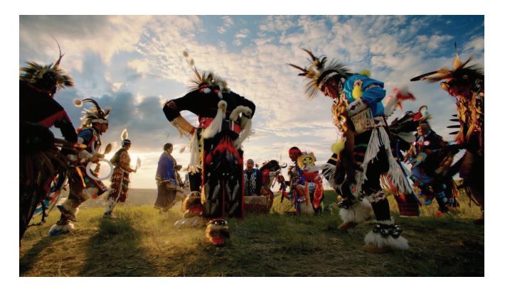
Sources: http://kahnawakepowwow.com/?page_id=18 https://www.powwows.com/pow-wow-etiquette2/

For more info and to view upcoming Pow wow schedules visit... https://calendar.powwows.com/ events/categories/pow-wows/pow-wows-insaskatchewan/